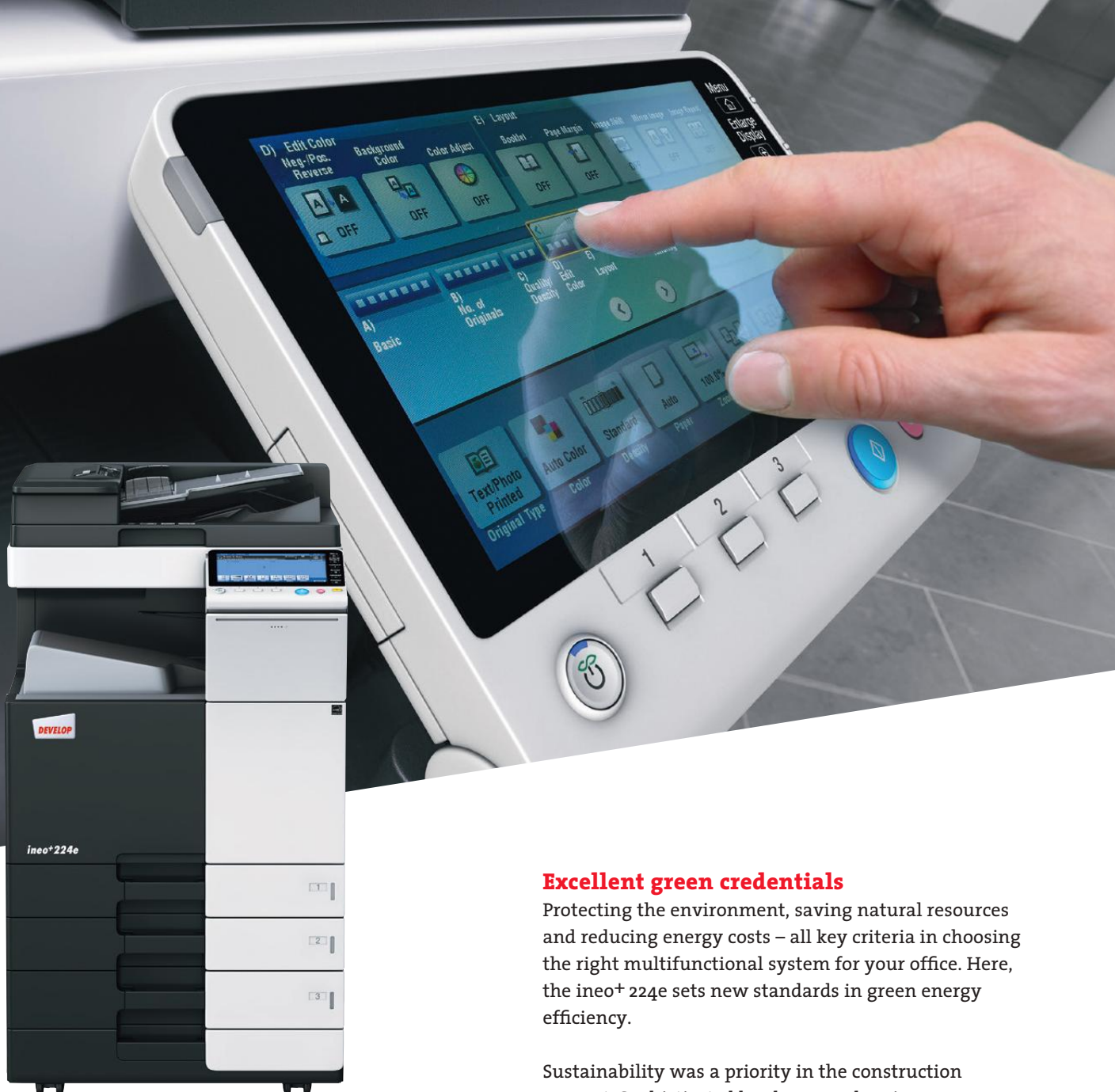
ineo+ 224e with paper feeder (PC-210) and dual scan document feeder (DF-701)