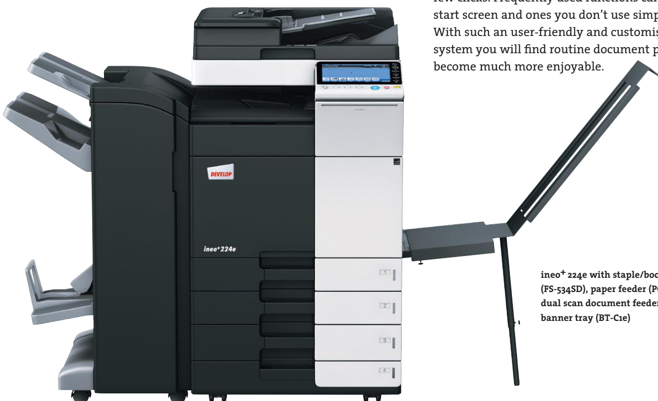
ineo+ 224e with staple/booklet finisher (FS-534SD), paper feeder (PC-210), dual scan document feeder (DF-701), banner tray (BT-C1e)

Many multifunctional office systems are anything but user-friendly. The ineo+ 224e, in contrast, is simplicity itself. An intuitive, easily understandable operating concept ensures that it is as easy to use as your smartphone or tablet. The 9-inch capacitive touchscreen comes with familiar multi-touch operations such as flick, drag&drop and pinch in&out – so you will feel at home in this system in no time at all. Thanks to a new menu navigation structure you can see all functions in one go and select the settings you want with just a few clicks. Frequently used functions can be left on the start screen and ones you don't use simply removed. With such a user-friendly and customisable office system you will find routine document production jobs become much more enjoyable.