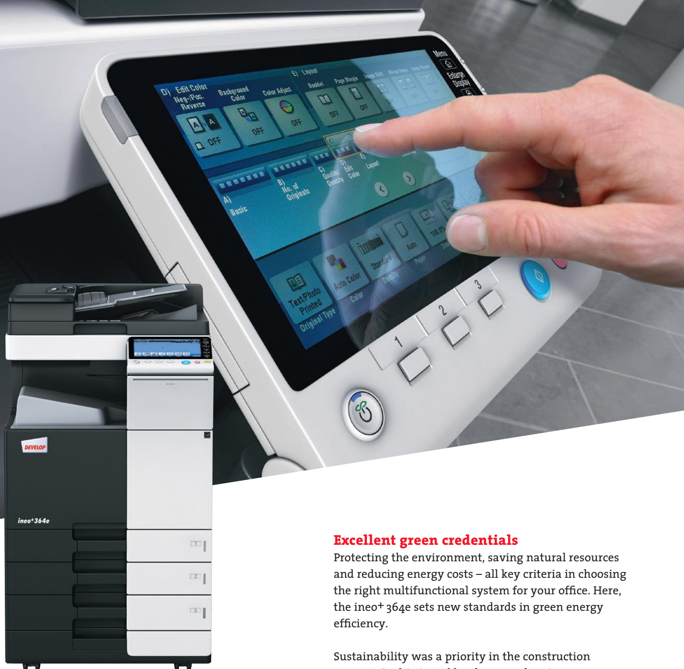
ineo+ 364e with paper feeder (PC-210) and dual scan document feeder (DF-701)